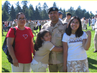
The Salas Family