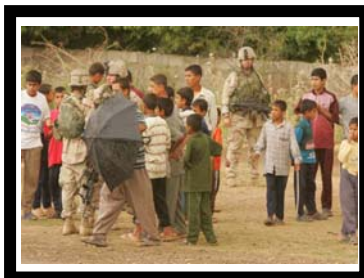
WINNING THE HEARTS & MINDS